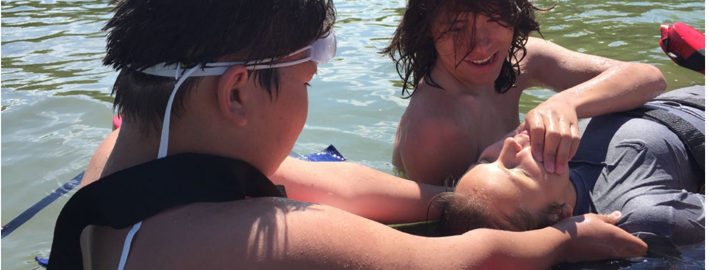
Youth practicing lifeguarding skills in a lake.

Canada's Indigenous population has a drowning rate 10 per cent higher than the national average and 15 per cent higher in children under the age of five. In order to help reduce these numbers, the Red Cross created the Indigenous Water Safety program in 2016.